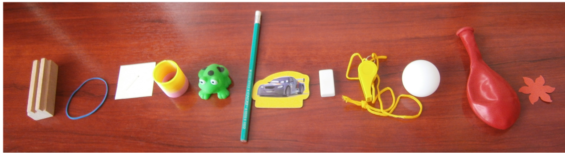
FIGURE 2 | Sample of toy ranking. The star (right) is ranked highest and the wooden block (left) is ranked lowest.

who all declared being a stay-at-home mother (Fisher's t -test: p < 0.001 , OR = 27.25 ). All fathers in School A were employed, ran a business or worked as a free-lancer, while 84% of the fathers in School B declared being unemployed. Fathers in School A were significantly more likely to work than fathers in School B (Fisher's t -test: p < 0.001 , OR = 24.29 ).